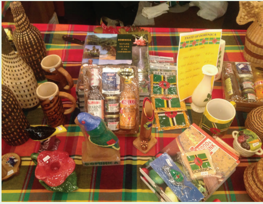
CCL Fair 2012 Dominica puts on a spectacular display and raises funds for charity.